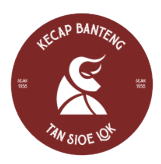
Figure 4 Final refreshing Kecap Banteng Visual Identity

characteristics of bull animals, female bulls as leaders of other bull herds will be alert and always pay attention to their environment when they are in a crowd and do eating and drinking activities for their growth. Step one of designing identity is create visual identity by modular grid to reconstructed part of symbol anatomy to set the proportional shape. According to Krause, (2012) emblem mark is the right choice for logo which using symbol and typeface in retro style. Bull symbol is refer to its name. The philosophy of Kecap Banteng new visual identity is implied. The up-half body structure of bull have an important meaning as a leader or someone with high position. This representative Kecap Banteng as the best local product in Cirebon. The direction of bulls head is in the right side has meaning of giving trust to consume